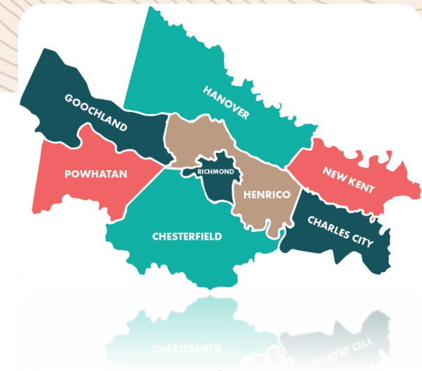
Serving Planning Service Area(PSA)15

Mission: Empowering Older Adults, Persons with Disabilities, and Caregivers to live with dignity and choice.